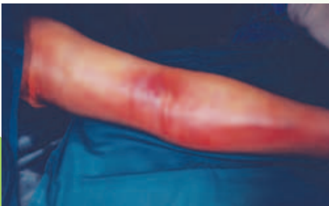
Necrotising fasciitis of the arm